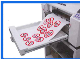
DRAWER (STORAGE SPACE)