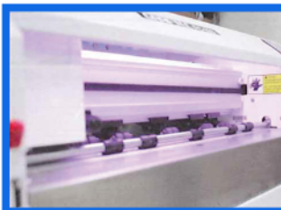
LED LIGHT FOR CUTTING AREA