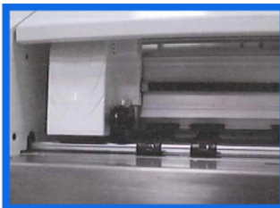
CARRIAGE (DRIVES THE CUTTER BLADE /PEN/CREASING TOOL)