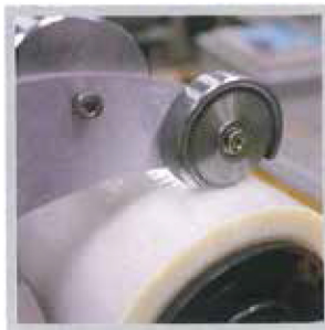
Dotted line / cutting