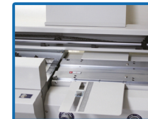
OPEN COVER CLAMP PLATFORM