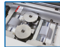
SIDE GLUE SYSTEM