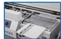
OPEN COVER CLAMP PLATFORM