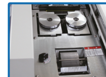
SIDE GLUE SYSTEM